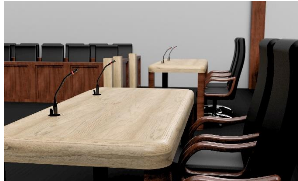
Shown above: C32E-SR-HALO-RF with SM80-X5 Shock Mount

The SM10-locking is a very low profile, through table microphone shock mount that comes with 3 Pin or 5 Pin XLR input and 3 Pin or 5 Pin Male XLR output.