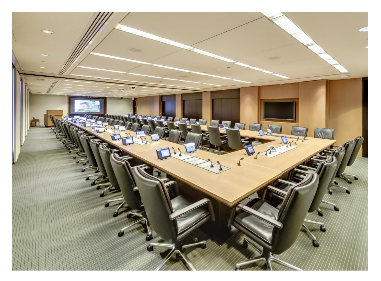
TABLE MICS & CONTROL CONNECTED WITH ONE CAT 5 CABLE

White Paper/Solution Spotlight CDT-100 TRANSPORTER via Dante Protocol