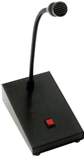
Illustration shows D 43 microphone

The DMB 1 is designed to be used as part of a paging microphone system for easy use in all types of industrial, entertainment and commercial environments.