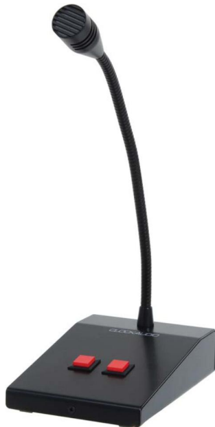
Illustration shows D 43 microphone

The DMB 2 is designed to be used as part of a paging microphone system for easy use in all types of industrial, entertainment and commercial environments.